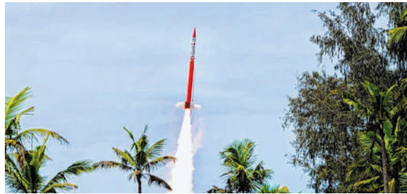
Flight path: The Rohini sounding rocket carrying the IAD lifting off from Thumba in Thiruvananthapuram on Saturday.

Describing the IAD as a "game changer" with multiple applications for future missions, the VSSC said this was the first time that an IAD had been designed for spent-stage recovery.