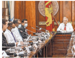
Sri Lankan President Ranil Wickremesinghe meeting with IMF staff on September 1.

China has signalled its willingness to lend more money to the country but has put the onus of restructuring past debt on Sri