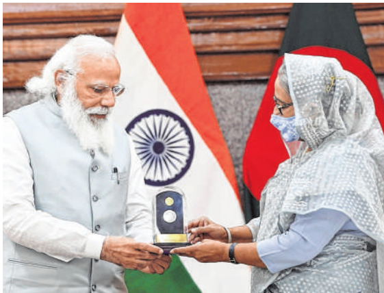
Cementing ties: Narendra Modi and Sheikh Hasina during the inauguration of various projects in Bangladesh in 2021.

"We are sensing that there will be an energy supply element in bilateral agreements between the two sides," said a diplomatic source without getting into the specifics. One of the hallmarks of Ms. Hasina's 13-year-old govern-