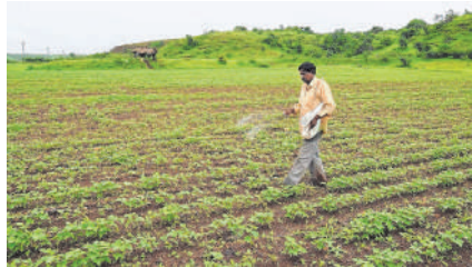
Key element: Nano urea contains nitrogen granules that are a hundred thousand times finer than a sheet of paper.

To produce one tonne of wheat grain, a plant needs 25 kg of nitrogen. For rice, it is 20 kg of nitrogen, and for maize, it is 30 kg of nitrogen. Not all the urea cast on the soil, or sprayed on leaves in the case of nano urea, can be utilised by the plant. If 60% of the available nitrogen was used, it would yield 496 kg of wheat grain. Even if 100% of 20 g of nano urea, which is what is effectively available, is utilised by the plant, it will yield only 368 g of grain, said