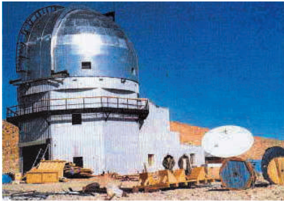
Reaching the stars: The Himalayan Chandra Telescope at Hanle in Ladakh.

A dark sky reserve is a designation given to a place that has policies in place to ensure that a tract of land or region has minimal artificial